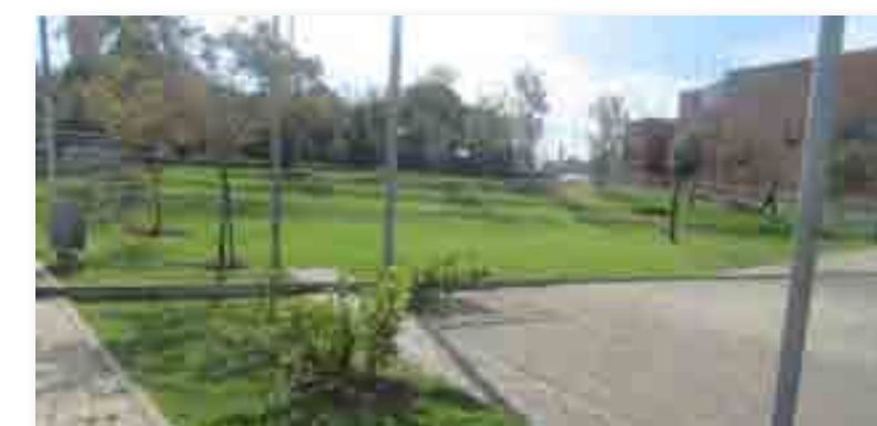
Hector Pieterse Precinct, Region D