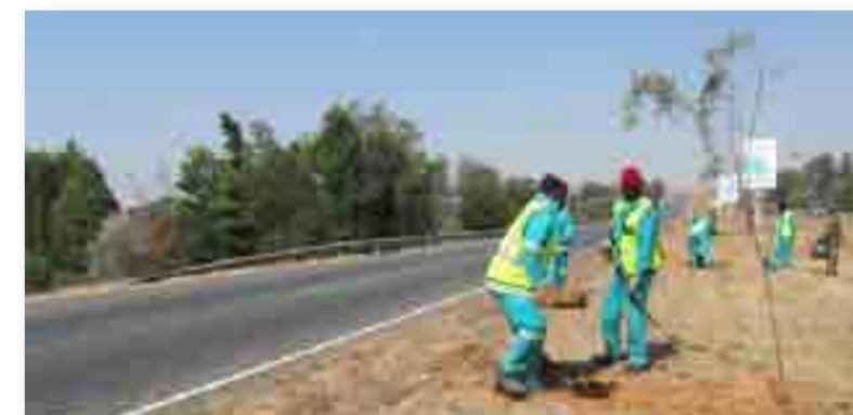
Tree planting: Northumberland Drive, Region C