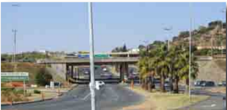
Hendrik Potgieter Rd, Region C