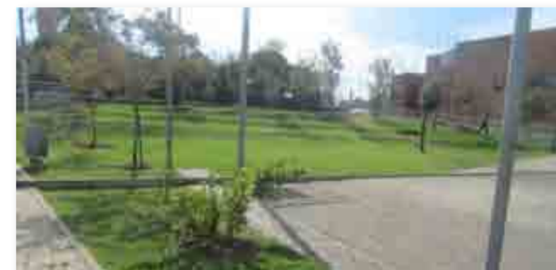
Hector Pieterse Precinct, Region D