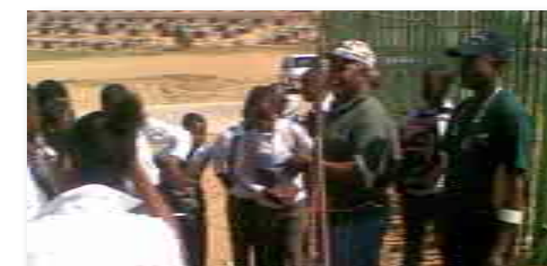
Cosmo City Secondary School no.3