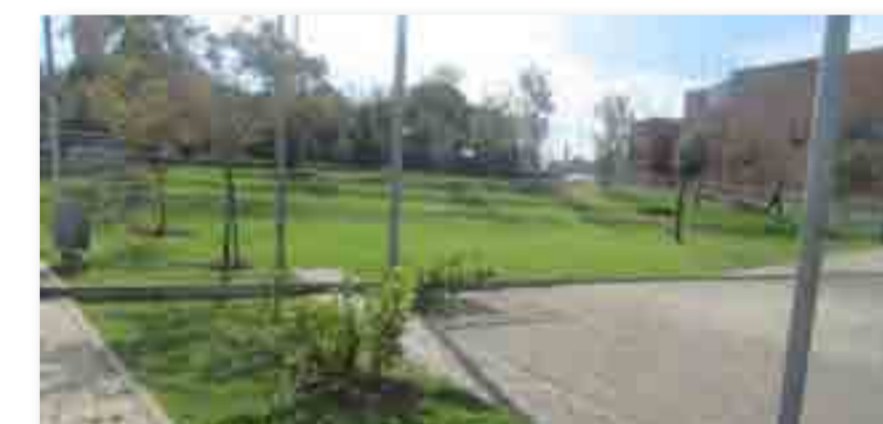
Hector Pieterse Precinct, Region D