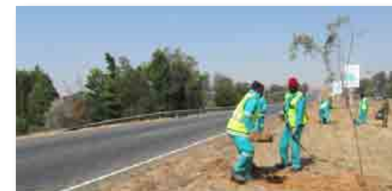
Tree planting: Northumberland Drive, Region C