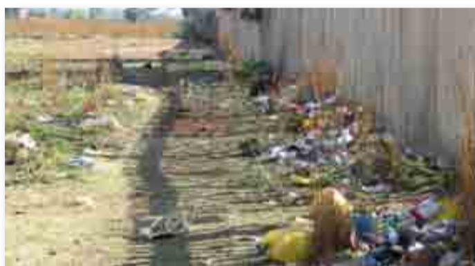
Eldorado Park: Before

During the 90 days Accelerated Service Delivery Programme, City Parks scooped a few awards