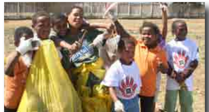
Clean-up: Eldorado Park