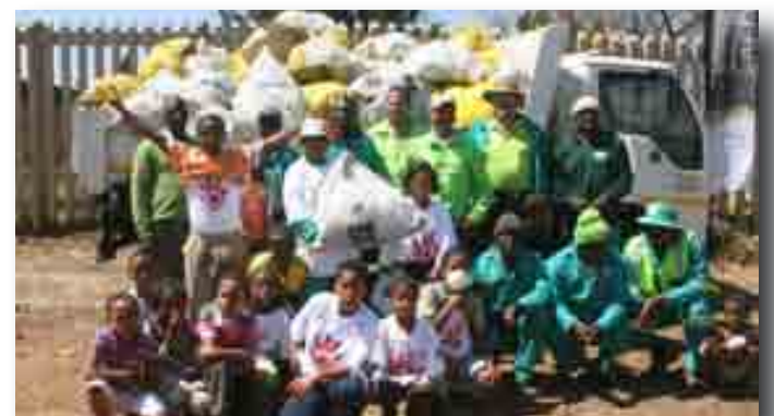
Clean-up: Eldorado Park