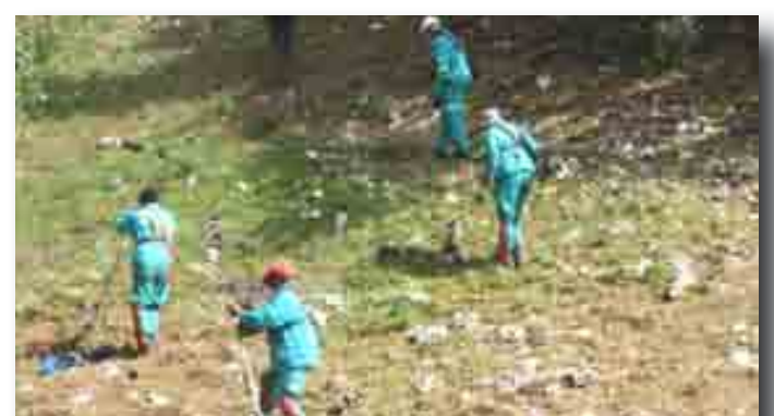
Clean-up: Pullinger Kop

Call complaints or service requests should be logged at Joburg Connect on 011 375 5555 - option 0