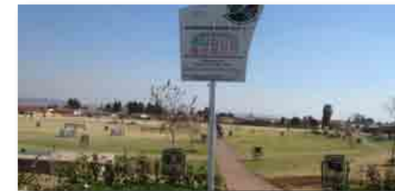
Eldorado Park Ext 3, Region G

Accelerated interactions with media, residents and key stakeholders. Hosted Mandela Day, Arbor Day and The Clean City Campaign. Issued statements on various seasonal service delivery issues.