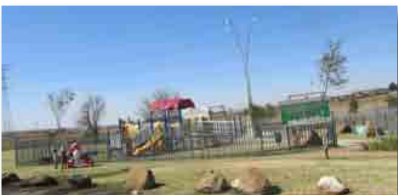
Dhlamini Eco Park, Region G