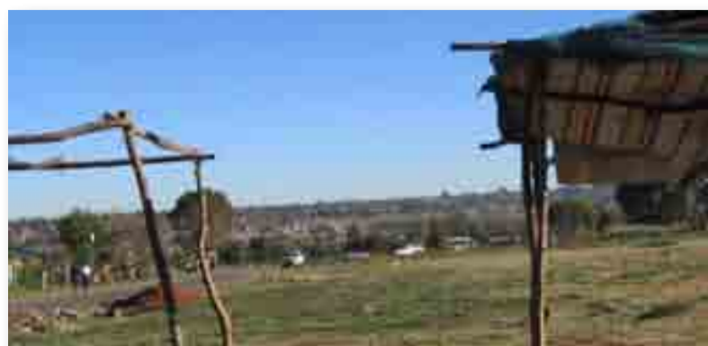
Informal Settlement Matholesville, Region C