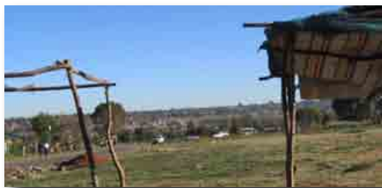
Informal Settlement Matholesville, Region C