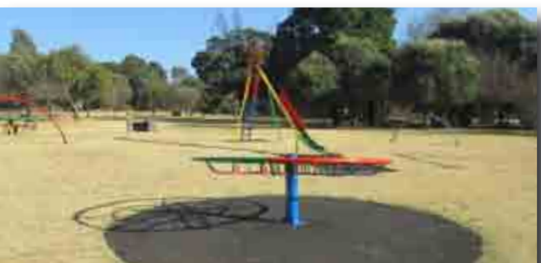
Community Parks maintenance in Cosmo City, Region C