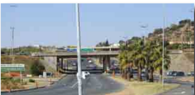
Hendrik Potgieter Rd, Region C