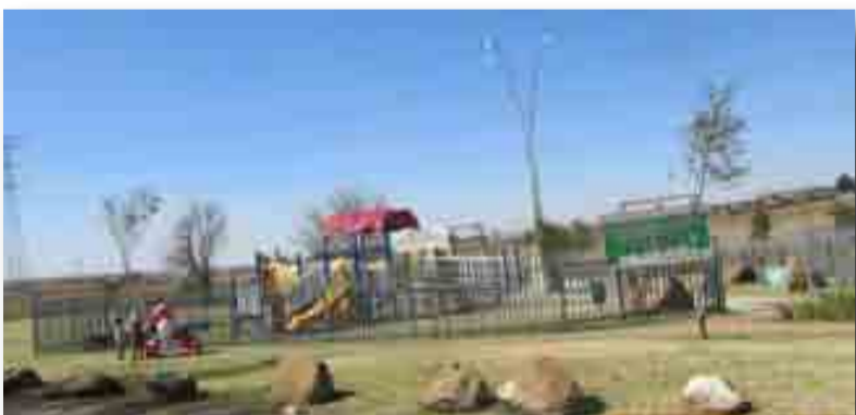
Dhlamini Eco Park, Region G