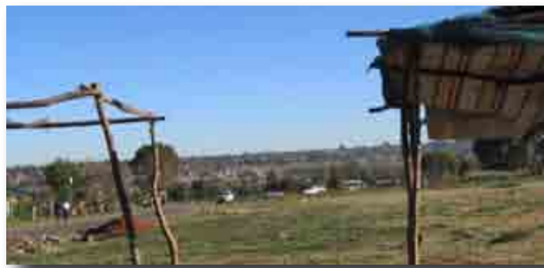
Informal Settlement Matholesville, Region C