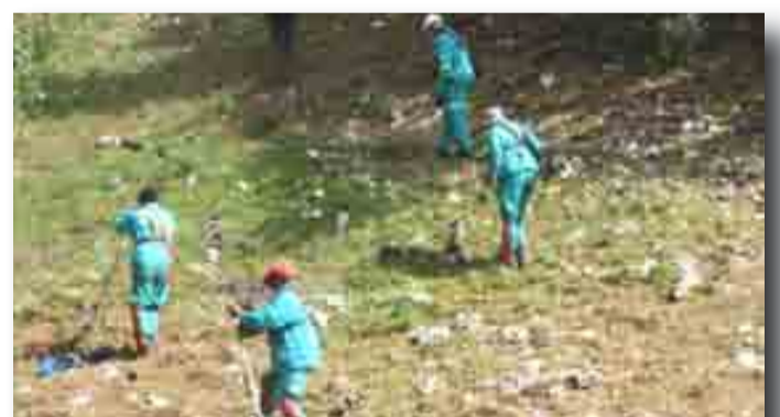
Clean-up: Pullinger Kop

Call complaints or service requests should be logged at Joburg Connect on 011 375 5555 - option 0