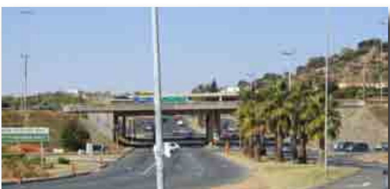
Hendrik Potgieter Rd, Region C