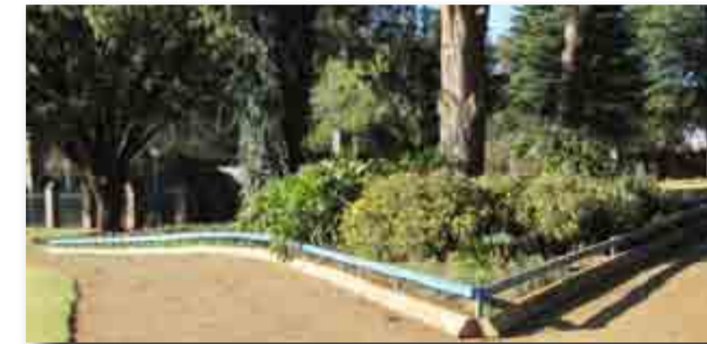
Litter free Florida Lake, Region C