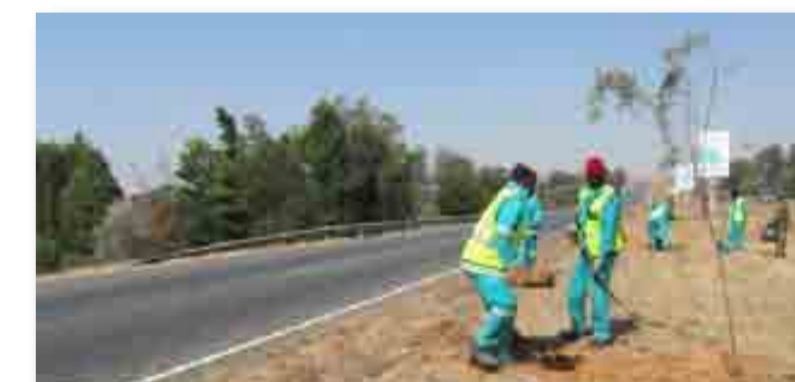
Tree planting: Northumberland Drive, Region C