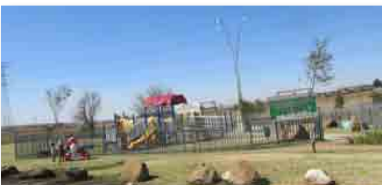
Dhlamini Eco Park, Region G