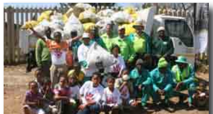
Clean-up: Eldorado Park