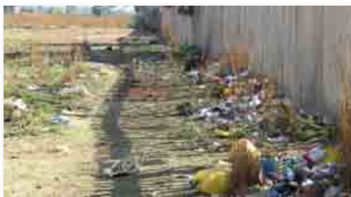
Eldorado Park: Before

During the 90 days Accelerated Service Delivery Programme, City Parks scooped a few awards