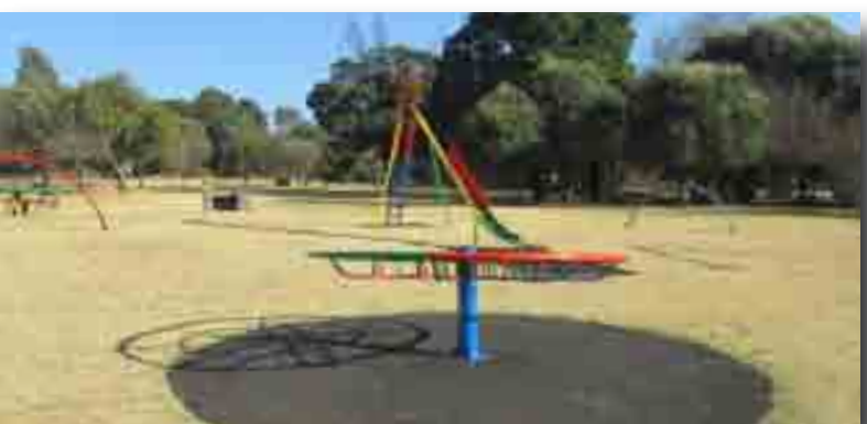
Community Parks maintenance in Cosmo City, Region C