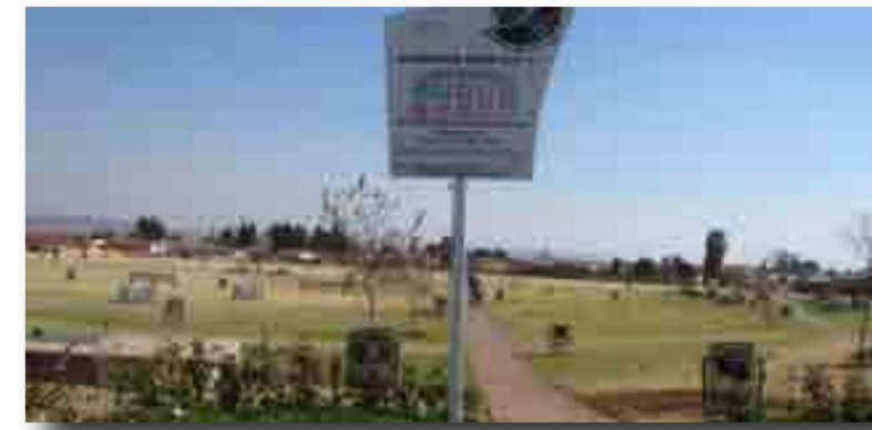
Eldorado Park Ext 3, Region G