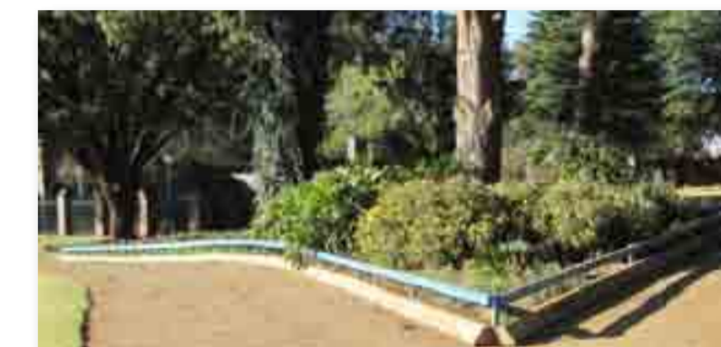
Litter free Florida Lake, Region C