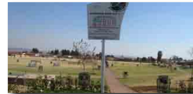
Eldorado Park Ext 3, Region G

Accelerated interactions with media, residents and key stakeholders. Hosted Mandela Day, Arbor Day and The Clean City Campaign. Issued statements on various seasonal service delivery issues.