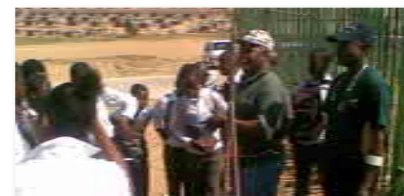
Cosmo City Secondary School no.3